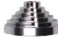
M60 Stepped Chuck 2-60mm