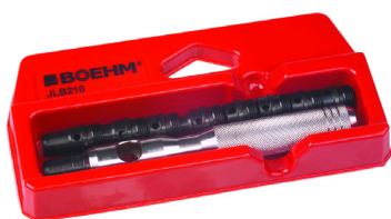
WAD Punch Kit 2-10mm JLB210