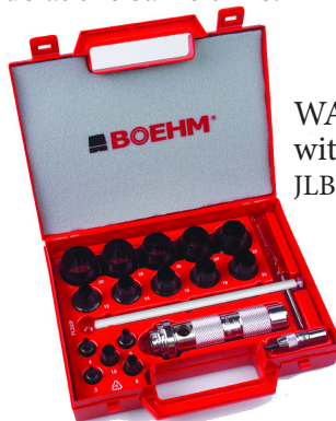
WAD Punch Kit 3-30mm with compass cutter JLB330P