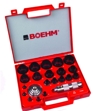
WAD Punch Kit 3-40mm JLB340P