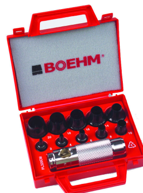
WAD Punch Kit 3-20mm JLB320CM