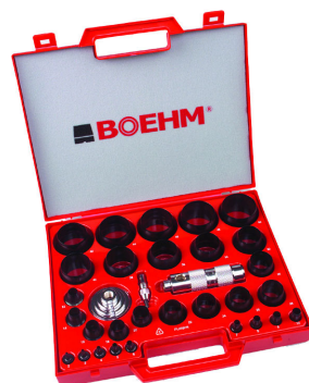
WAD Punch Kit 2-50mm JLB250P